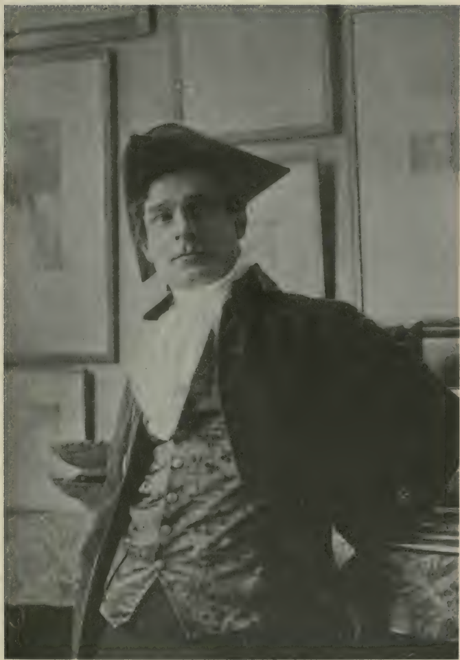
MANSFIELD AS DICK DUDGEON